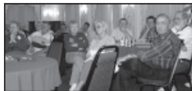
Is this an interesting meeting, or what?

and federal parks, stopping at resorts that even Presidents have enjoyed and marveling at the fantastic formations of the hills. A highlight was our visit to Mt. Rushmore, where we had plenty of time to view historical sights, take pictures and do some required souvenir shopping. Another special treat was seeing the Crazy Horse Monument, which is still in the construction phase but nonetheless very imposing and has a terrific visitor center and art gallery. On one of our excursions we even stopped at Deadwood City, a colorful western-style town where every store, hotel and shop featured a casino, or at least a battery of slot machines, in the front of the establishment. We also visited the site of what was once one of the largest and most prolific producing silver mines in the world.