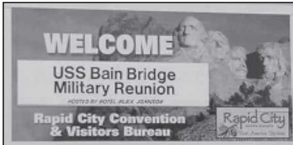
An impressive welcome in Rapid City.

For those of us who gathered in Rapid City, South Dakota on September 26 through 29 at the historic Hotel Alex Johnson, right in the old downtown area, this reunion offered lots of the old and plenty of new. Meeting in this mid-United States city, far from any seaport, lent an interesting twist to a Naval reunion. (Is this a pattern, the last one was in the desert!?) The weather was great, the scenery was terrific and reunion was one of our best.